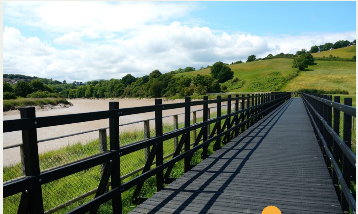
View of boardwalk near Caerleon