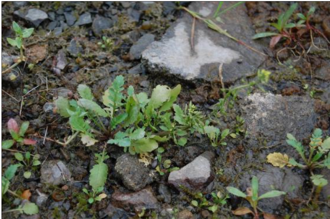
Rorippa islandica – Northern Yellowcress on damp ground at Nantgarw.

Virtually all of the plants are common and widespread and of little interest, but the Rorippa islandica – Northern Yellowcress is worthy of note. It is a small annual of damp, open ground. It was very rare in Britain 20 years ago, but has spread dramatically in recent years and is now widespread in South Wales (this is the fourth site in Cardiff I am aware of). It occurred in three seasonally inundated hollows on the waste ground at the rear at Nantgarw, and will be easy to maintain by keeping the habitats in similar condition.