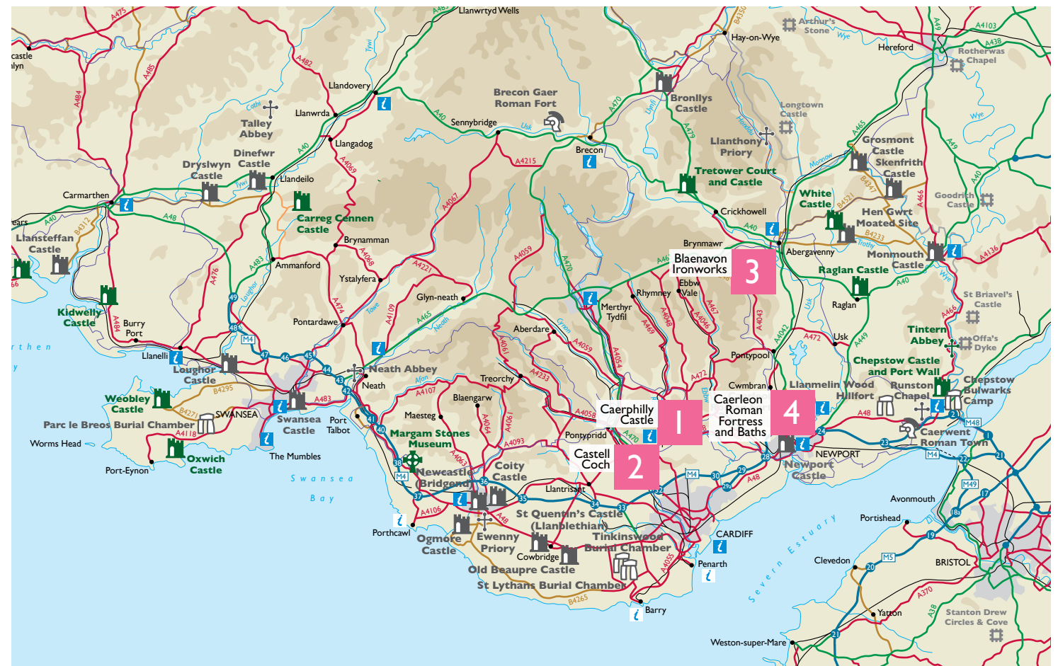
The journey time from Cardiff to Castell Coch is approx. I 5 minutes, 20 minutes to Caerphilly, 30 minutes to Caerleaon and 45 minutes to Bleanavon.

These are just four of the 128 historic sites in our care, visit; cadw.wales.gov.uk to discover the stories and people behind them. 'Like' Cadw on Facebook and follow @Cadwwales on Twitter or download our smartphone app to stay up to date.