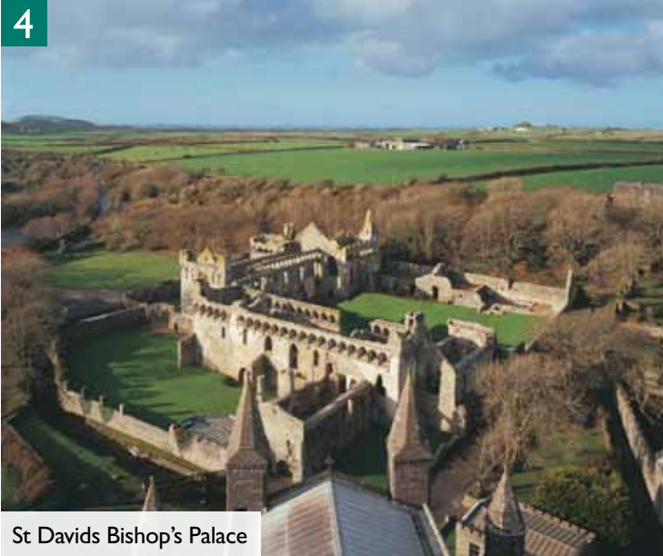
St Davids Bishop's Palace

Henry de Gower was also responsible for St Davids Bishop's Palace , the most impressive medieval bishop's palace in Wales. The whole site sends shivers down the spine, evoking a period when religion was the order of the day and bishops were powerbrokers par excellence. The palace is lavishly decorated with finely carved stonework. Check out the great hall, the most impressive chamber in the palace, which created the perfect backdrop for banquets. And be sure to explore the extensive undercrofts and majestic porch, an entrance befitting the majesty of such an iconic building.