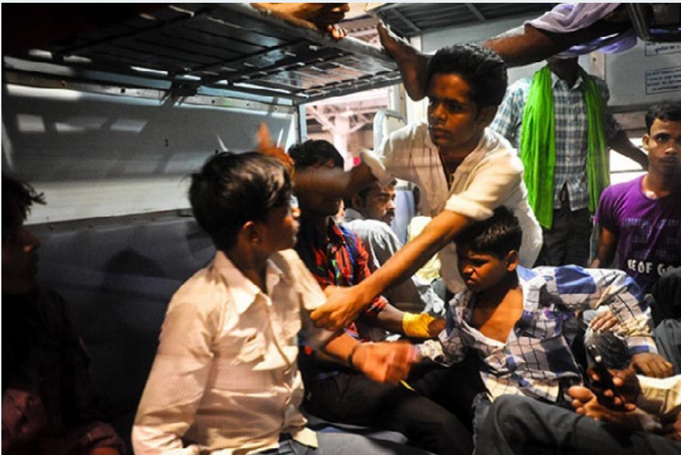
An anti-child labour activist struggles to rescue a young boy during an operation targeting child trafficker.