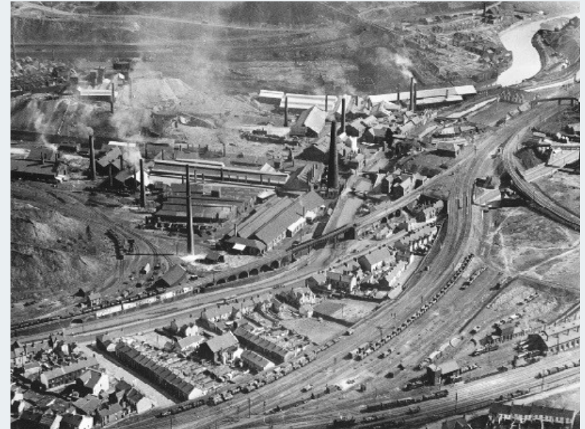
Hafod Copperworks, Swansea