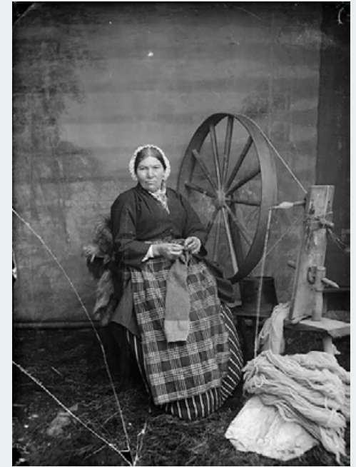
CASGLAD Y WERIN CYMRU / PEOPLES COLLECTION WALES