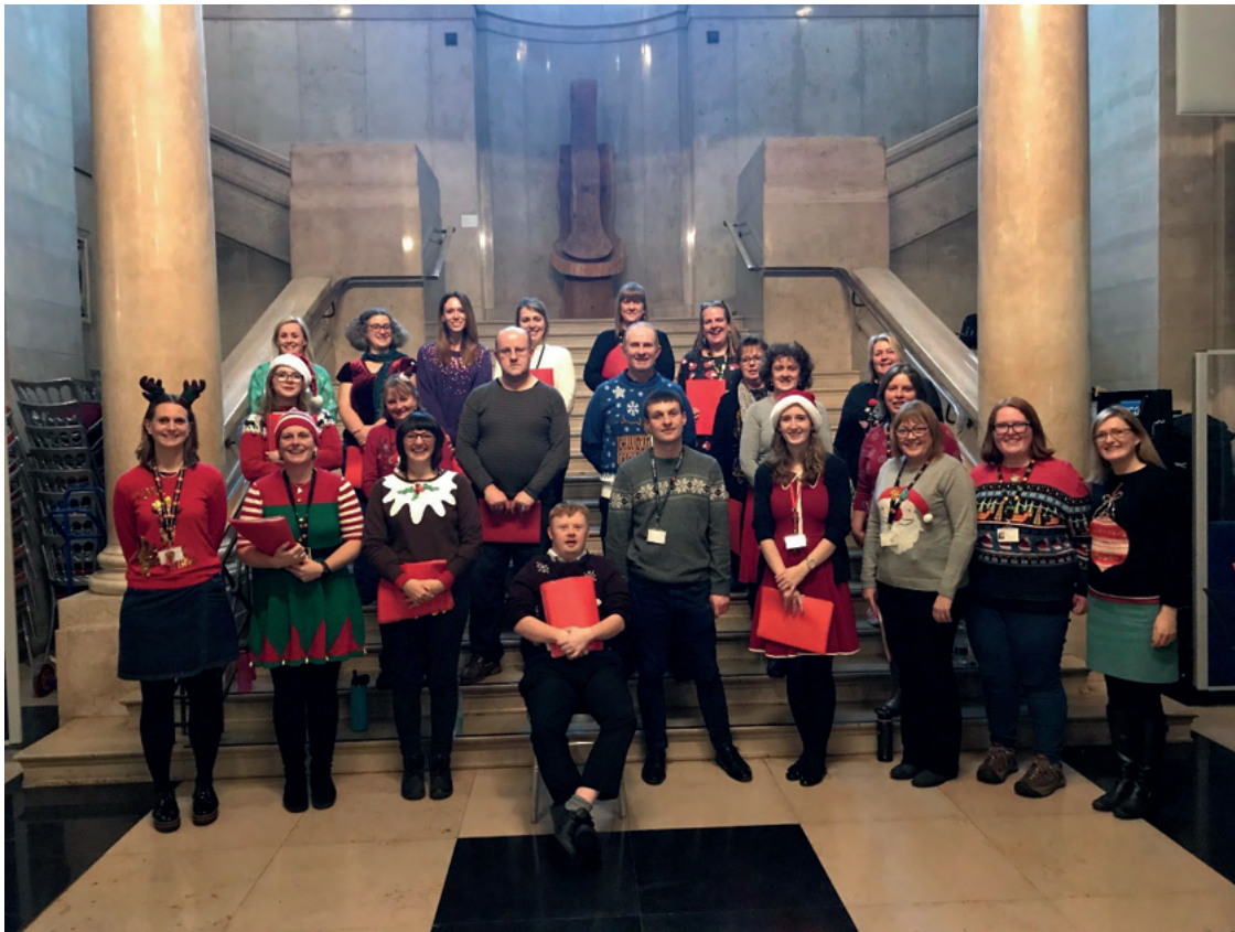
The Amgueddfa Cymru choir.

Singing in a group has so many positive health and wellbeing benefits. How does singing with others make you feel?