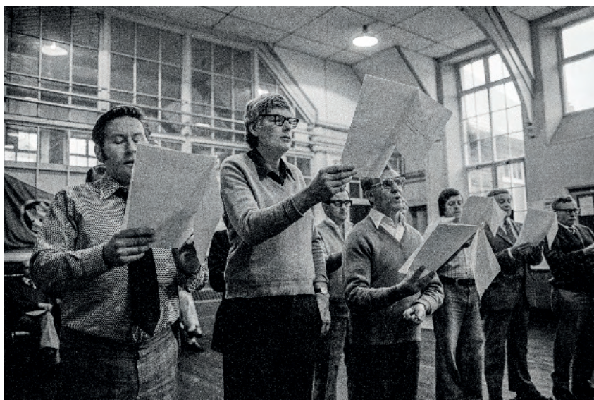
Male voice choir in rehearsal. Treorchy, Wales.

When mass unemployment and hardship hit in the 1920s and 1930s, choirs often remained an emotional and social lifeline for many individuals living in industrial communities.