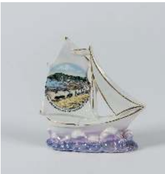
Souvenir from Aberystwyth.