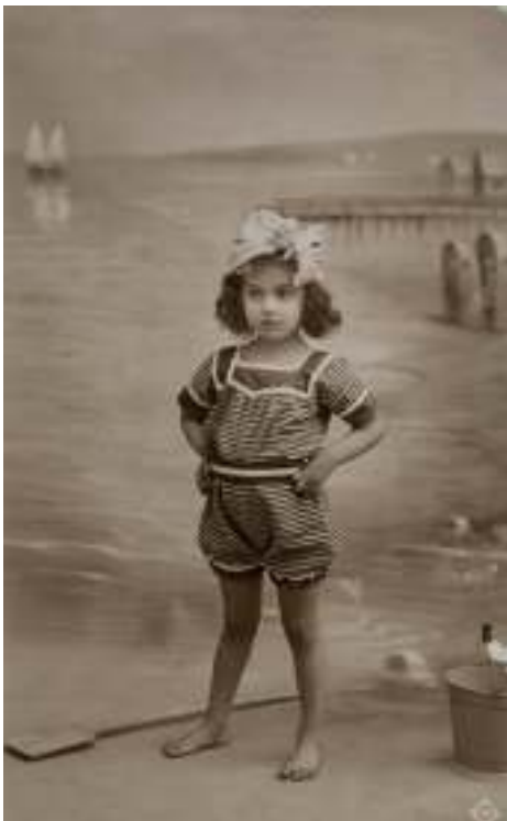
This postcard is postmarked New Quay, Cardiganshire, 1920. It was sent to an address in Church Village.