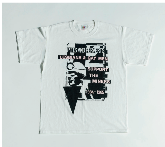
'Pits and Perverts' T shirt produced as a promotional item for the 2014 film 'Pride'.

The LGSM organised a benefit concert for NUM funds at the Electric Ballroom in Camden. Known as the 'Pits and Perverts' gig, it was headlined by Jimmy Somerville and Bronski Beat.