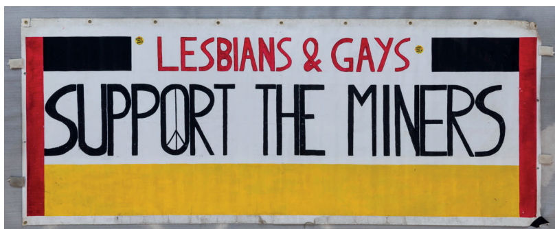
Copy of original 'Lesbians and Gays Support the Miners' banner made for the 2014 film 'Pride' which told the story of the links between the LGBTQ community and NUM South Wales Area.

The events of this story were depicted in the 2014 film 'Pride'.