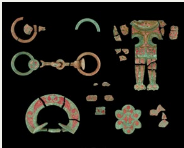
Image left: Bronze chariot fittings decorated with late Celtic Art designs, found at the burial site